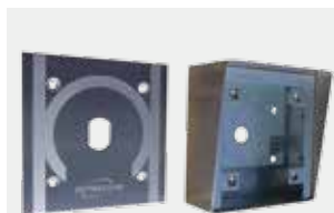
SURFACE-MOUNTED Size: 125 x 125 x 57 mm - IP66