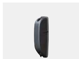
Size: 46 x 180 x 66 mm - IP55