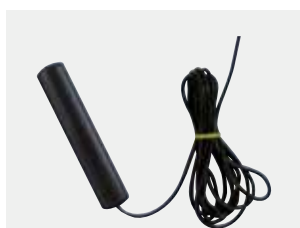
Size: 22 x 115 x 7 mm - IP55