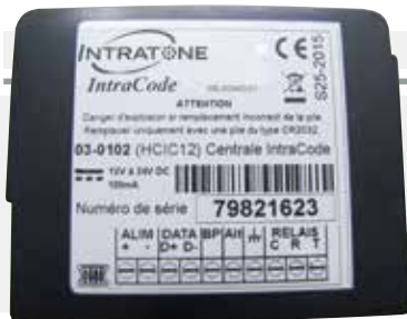
03-0102-XX: Central unit for 1 door and/or 100 names