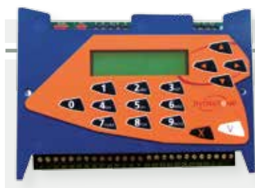
03-0101-XX: Central unit for 4 doors and/or 1,000 names

✔ Up to 30 central units connected via 1 bus