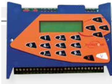
03-0101-XX: Central unit for 4 doors and/or 1,000 names

✔ Up to 30 central units connected via 1 bus