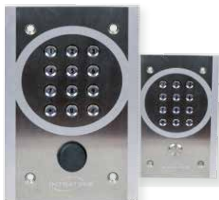
12-key backlit coded keypad + push button, with or without proximity reader