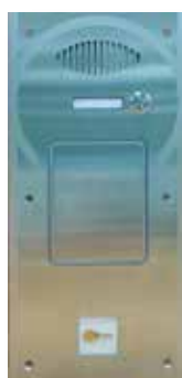
1 audio-call button version