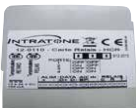
12-0110-XX: Relay card for the 1-door central unit (03-0102-XX)