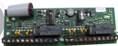
12-0109-XX: Extension card for the 2-door central unit (03-0101-XX)